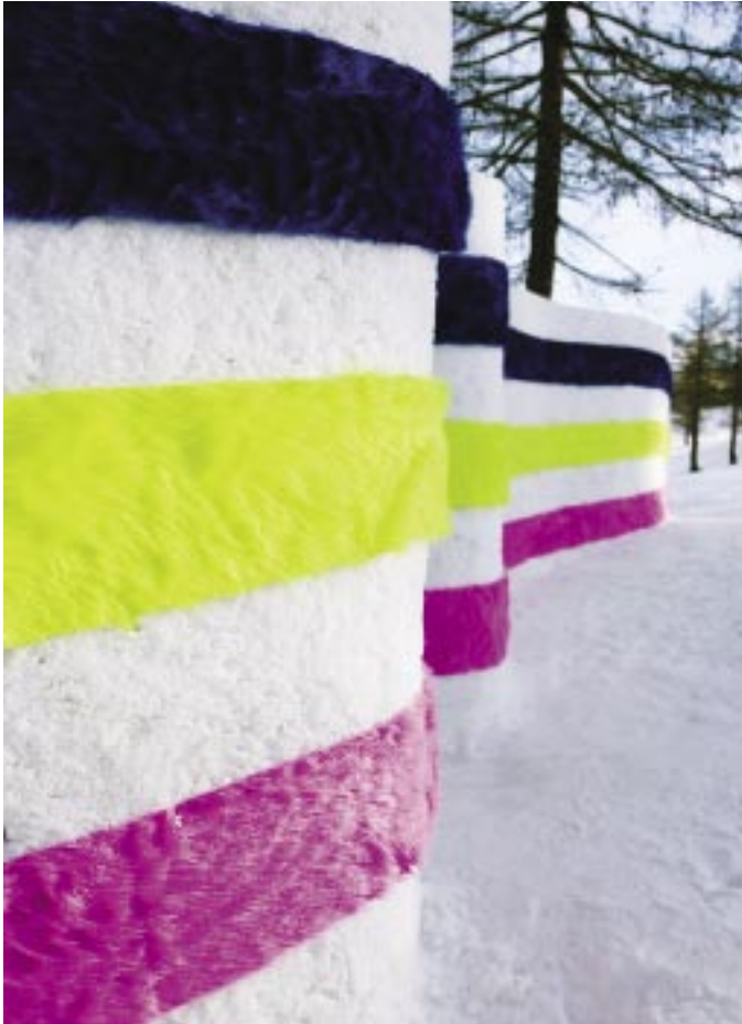
Untitled, Paola Pivi and Cliosstraat, 2006