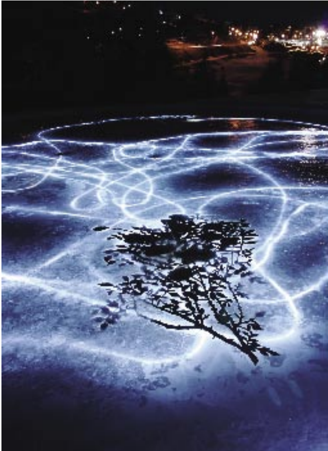
Looking Glass , Kiki Smith and Lebbeus Woods, 2006