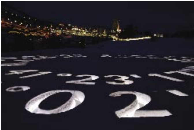
Where Are You? , Jaume Plensa and Norman Foster, 2006