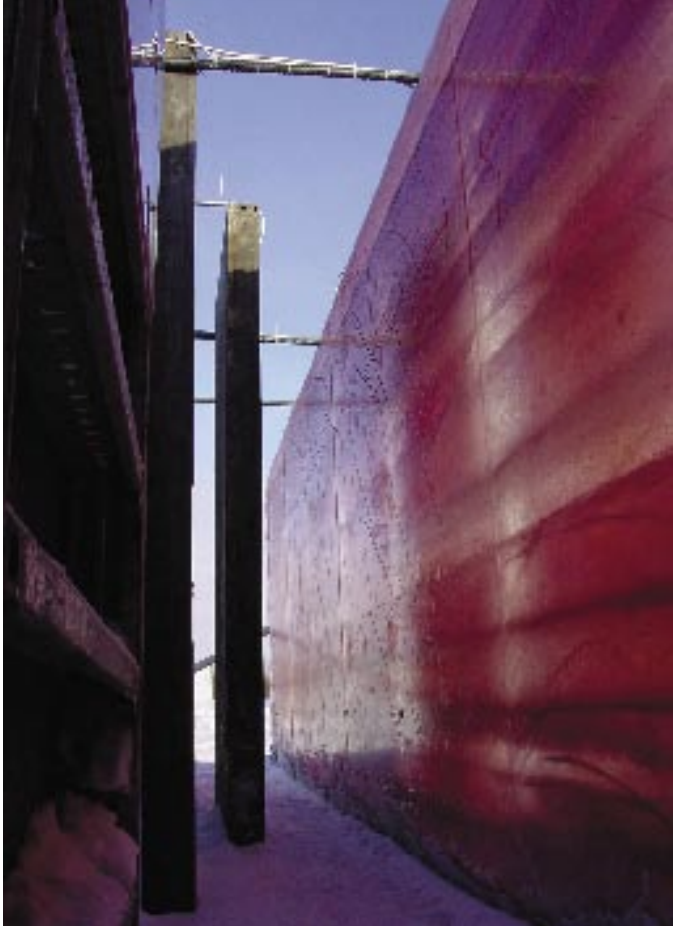
Coloured Ice Walls , Top Changtrakul and LOT-EK, 2004