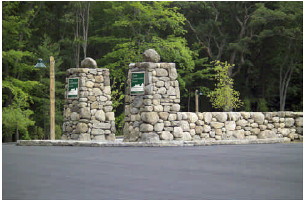
Architect: HKT Architects Inc., Landscape Architect: Hays/Watson & Associates, Copyright © Dan Goss / Blue Dog Photo, Inc.