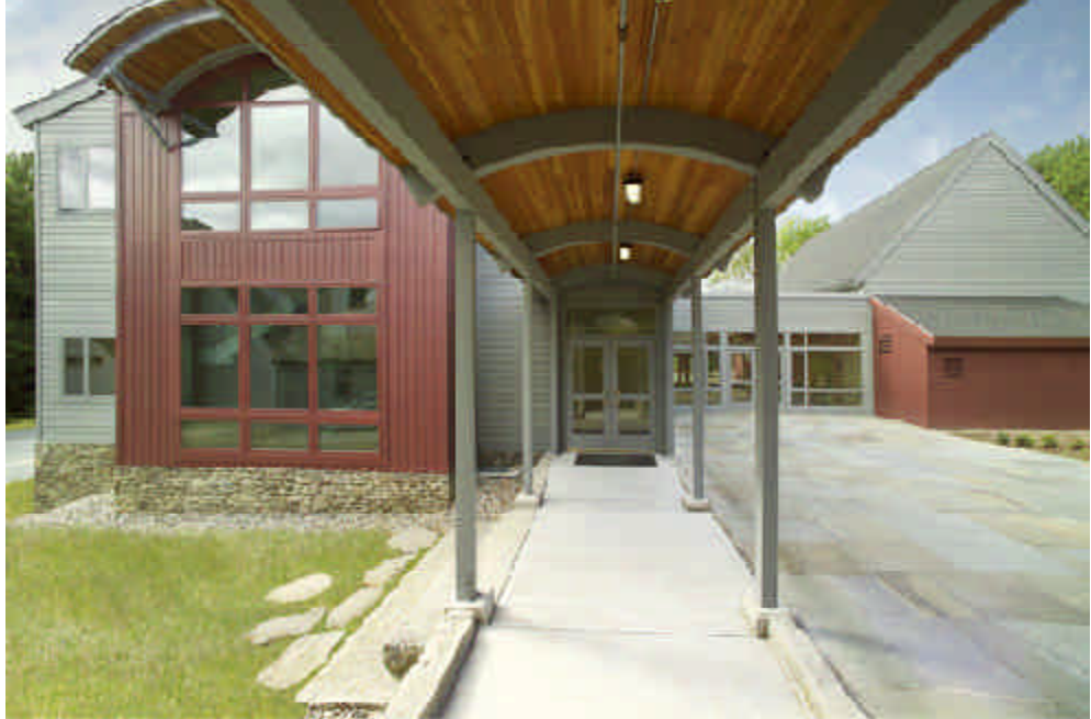
Architect: HKT Architects Inc., Landscape Architect: Hays/Watson & Associates