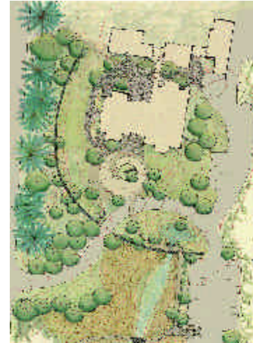
Hines Wasser & Associates LLC

Noteworthy Project Goal LEED Gold Rating or Higher