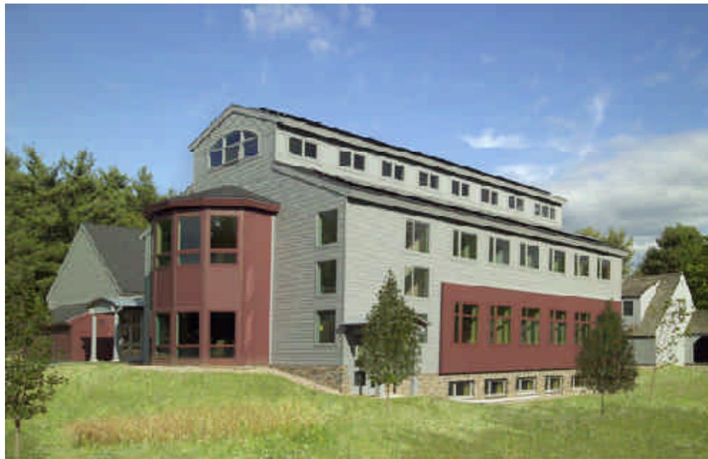
COURTESY: HKT ARCHITECTS INC. LANDSCAPE ARCHITECT: HINES WASSER & ASSOCIATES. COPYRIGHT © LOWE GRIFFIN PHOTOGRAPHY, INC.