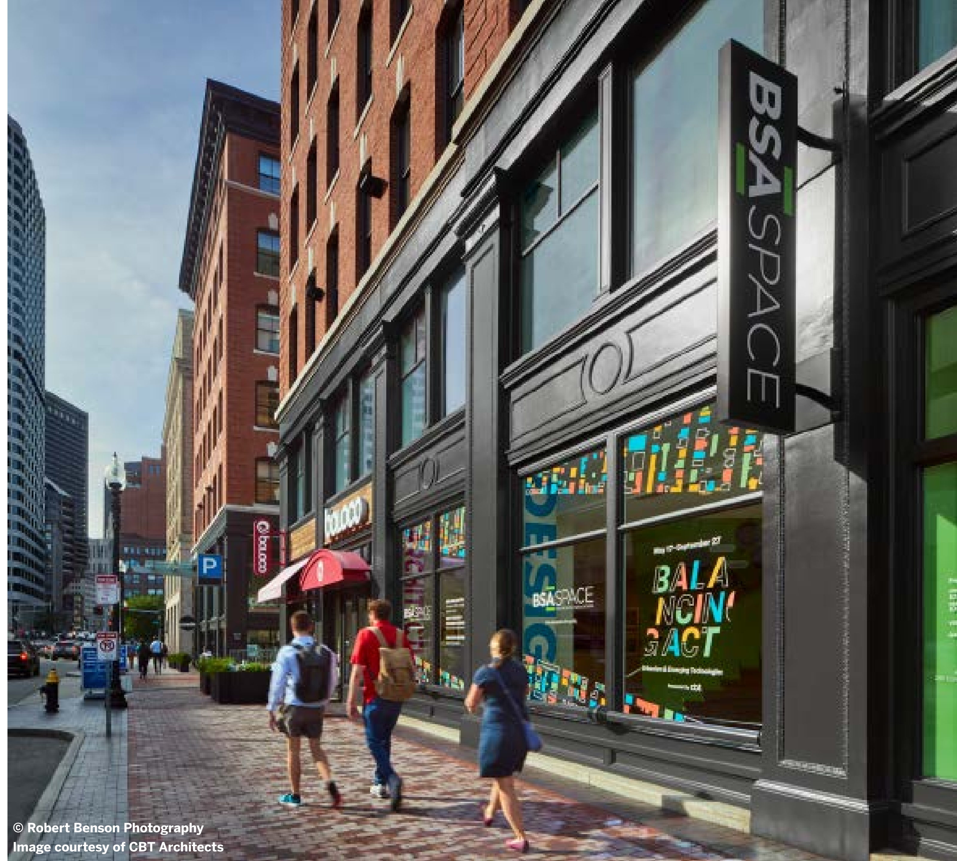
© Robert Benson Photography Image courtesy of CBT Architects